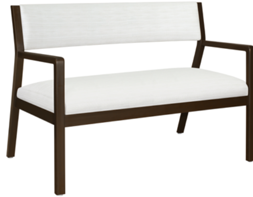
Model: CTEB22 46W 24.5D 33.75H 42.5SW 19SD 19SH 25AH

In any healthcare setting where two would like to sit comfortably together, the Caterina Bariatric – 46W Upholstered Back is a beautiful solution. The single back and seat cushion are just wide enough for a parent and small child. Wallsaver legs keep walls in pristine condition. Only available in an upholstered back, this seating option works well in lobbies, lounges, reception areas and emergency waiting rooms.